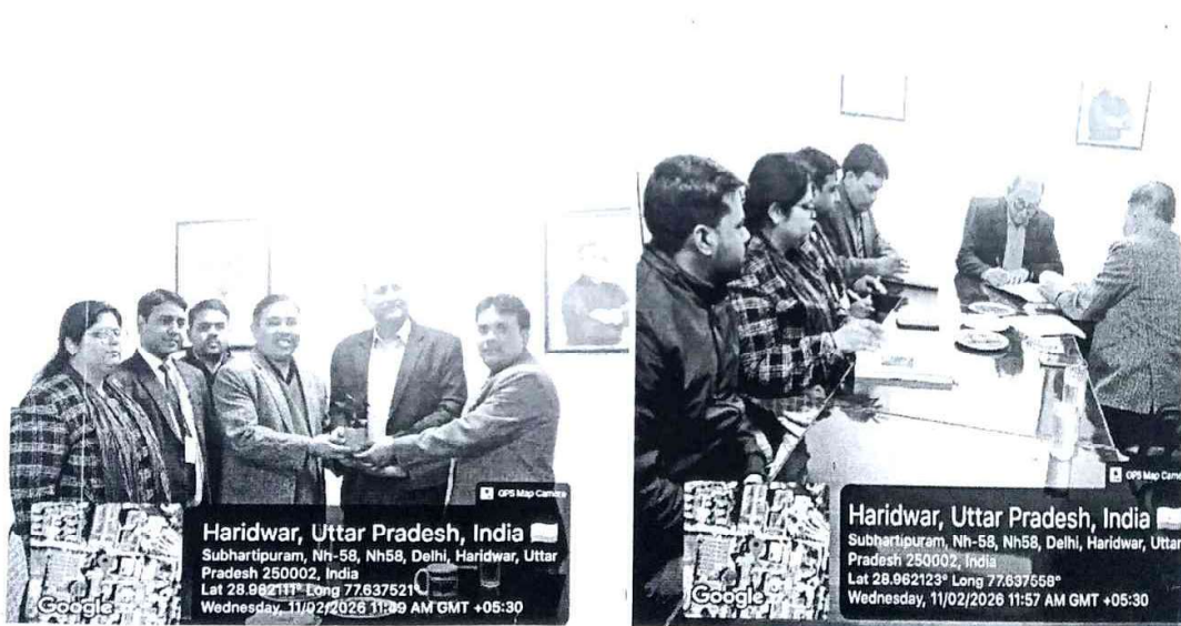
Geotag Images of BOS Meeting