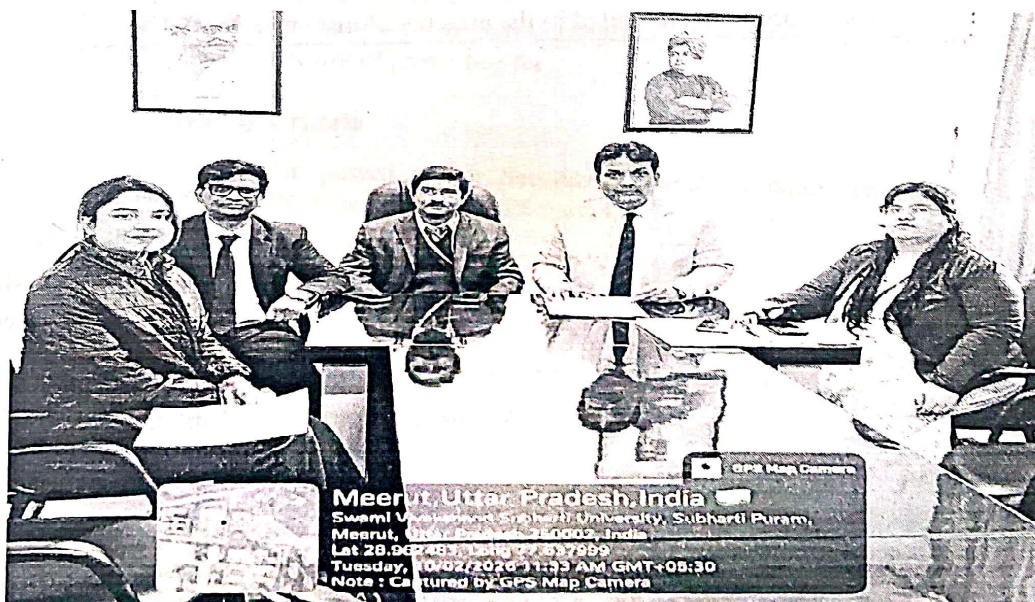
Geotag Image of BOS Meeting